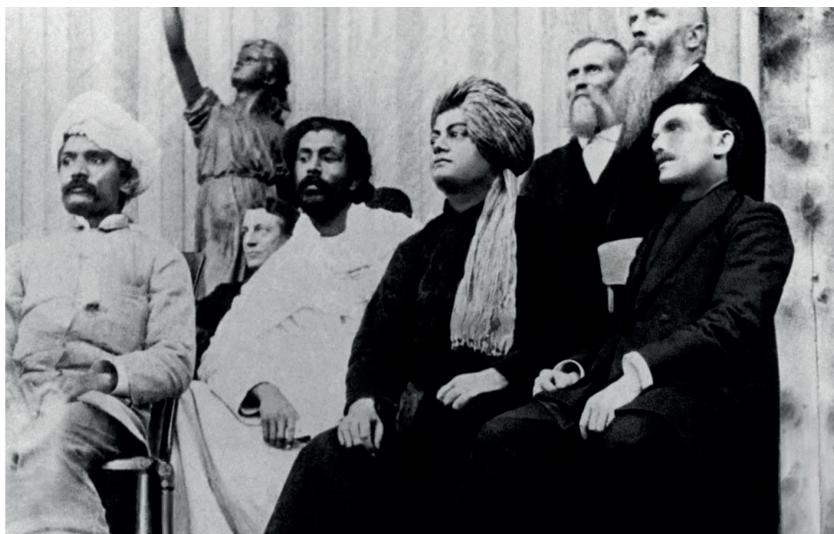
Swami Vivekananda at the Parliament of the World's Religions, Chicago, 1893

The experience of widespread impoverishment, starvation and a resultant stagnation of masses evoked severe pain and passion in Swamiji's heart. The ideas about the regeneration of his motherland started maturing in mind. He sincerely felt the need of scientific and technological knowledge, as that